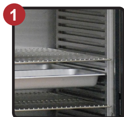
Versatile Fixed Rack