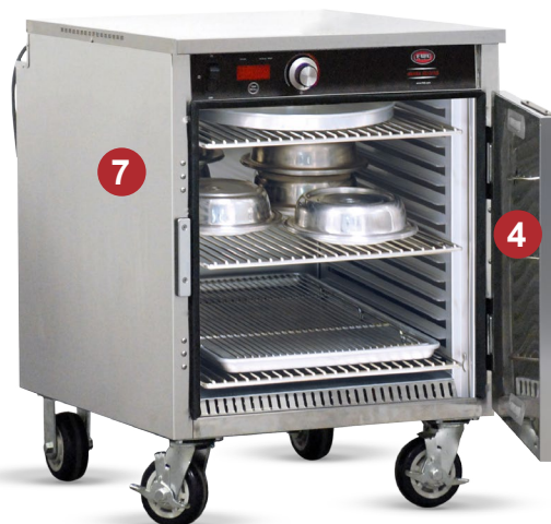
HLC-2127-6 (Shown with Standard Rack Assembly / Shelves)