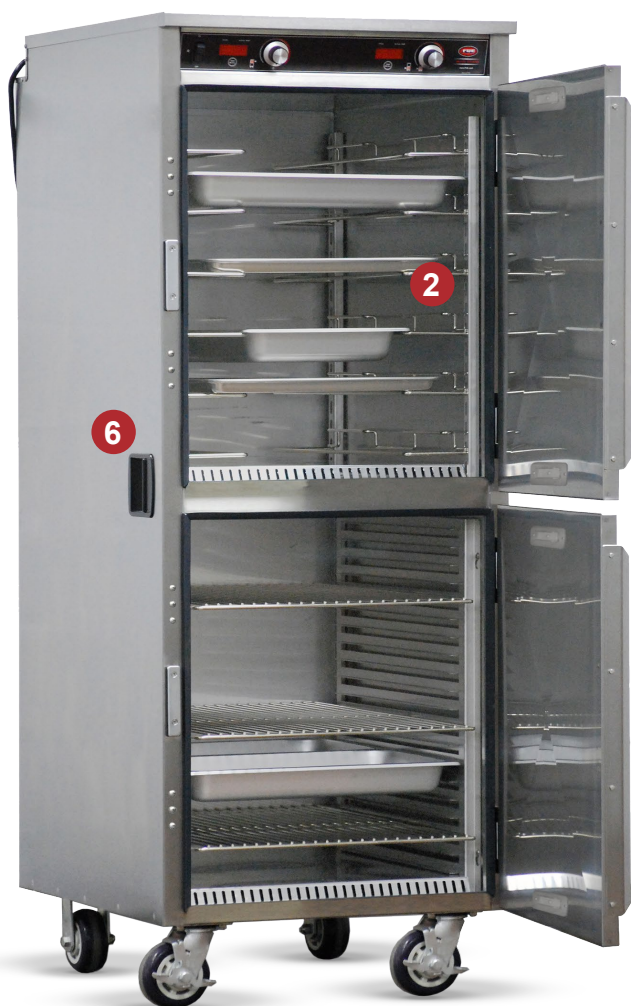
HLC-2127-9-9 (Shown with Optional Accessory Adjustable Tray Slides in Top Compartment)

Insulated cabinet holds pre-cooked foods at desired temperature with an easy-to-use thermostat.