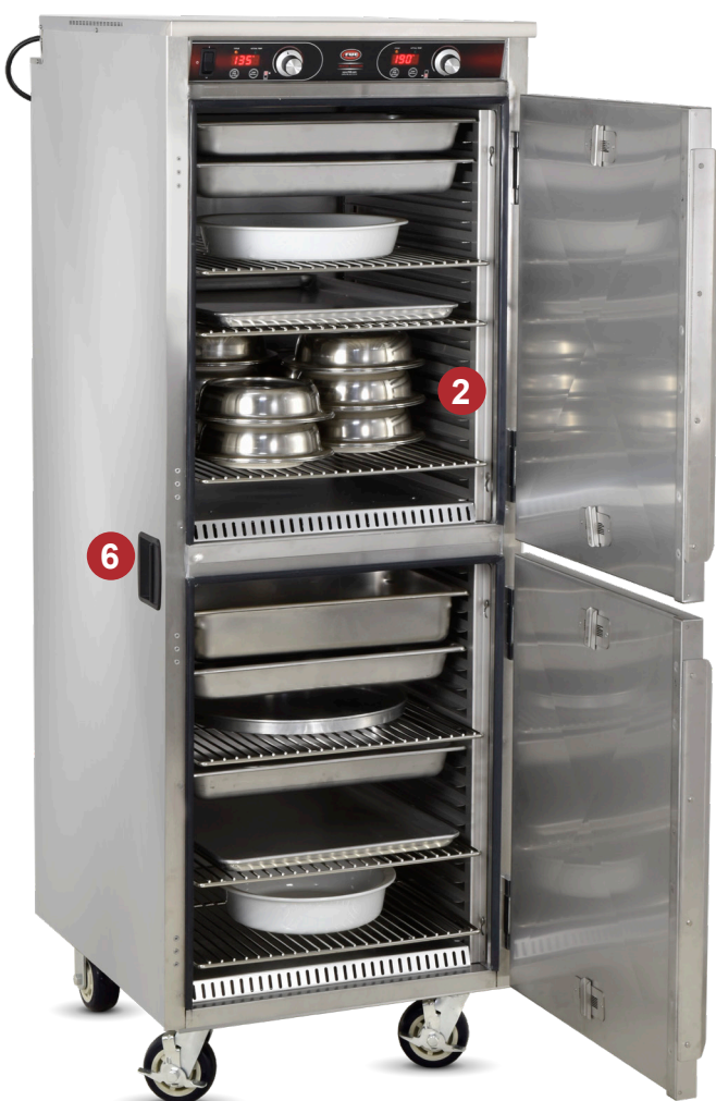
HLC-2127-9-9 Quick Ship Item

Insulated cabinet holds pre-cooked foods at desired temperature with an easy-to-use thermostat