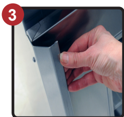
Magnetic Work Flow Door Handle