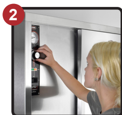
Eye Level Control Panel