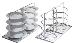
UP carries Uncovered Plates