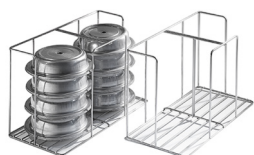
CP carries Covered Plates