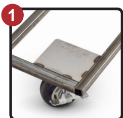
Tubular Welded Base Frame