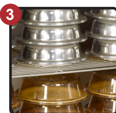
Heavy-Duty "No Sag" Shelves