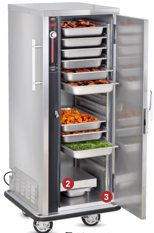
PS-1220-15 (Shown with Optional Accessory Electronic Controls)