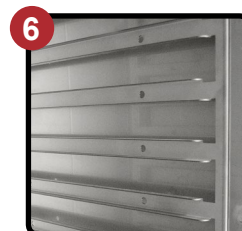
Fixed Rack Assembly