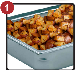
Bulk Food Reheating