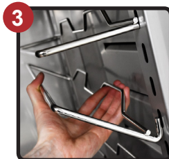
Adjustable Tray Slides