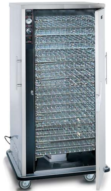
UHS-24-B with adjustable spacings

High capacity heated holding cabinet to compliment your speed-line operation.