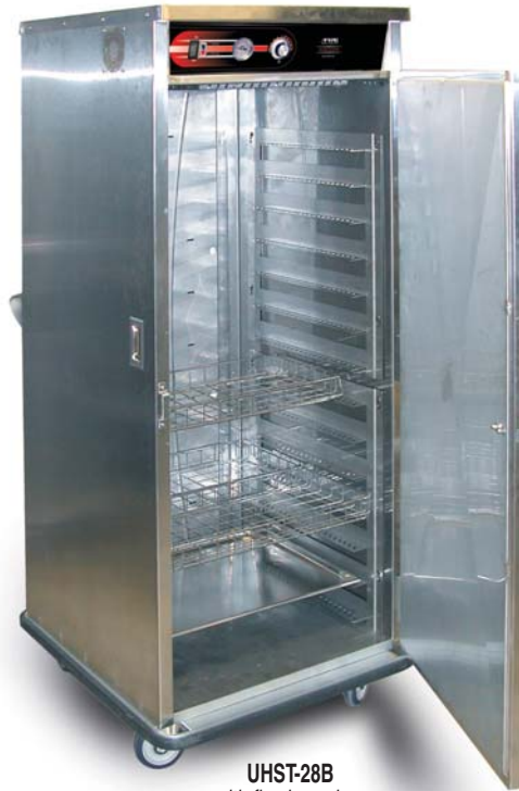
UHST-28B with fixed spacings