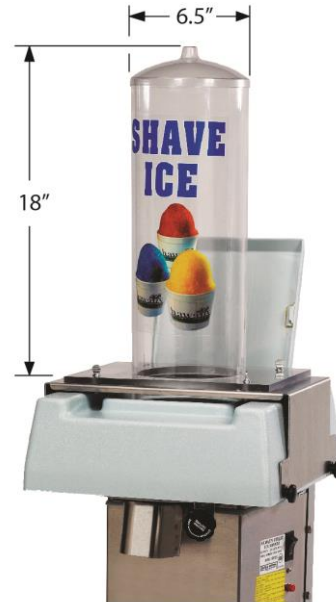
Maxim-Icer Option (sold separately)