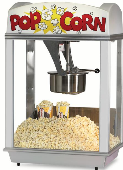
General reference image shown.