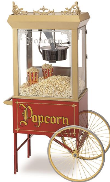
Popper shown on Cart 2015 for reference only (cart sold separately).