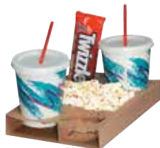
Jiffy Drive-In Tray #5200 Case Count: 250 Ship Weight: 25 lbs