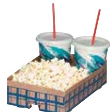
Carry-Out Tray #5206 Case Count: 250 Ship Weight: 28 lbs