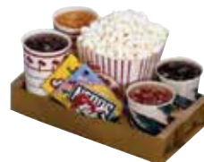
Concession Tray #5203 Case Count: 200 Ship Weight: 56 lbs