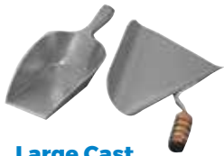
Large Cast Aluminum Scoop #2074 Right-Handed Stamped Aluminum Scoop #2073