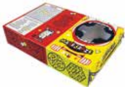
Marquee Movie Tray #2101 Case Count: 250 Ship Weight: 31 lbs