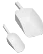
Large Ice & All-Purpose Plastic Scoop #2076 All-Purpose Scoop #2071NM