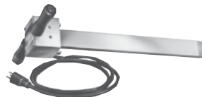
Excalibur Hot Wand (Oil Melter) #2018 Melts oil like butter, for super-fast melting of buckets of hard coconut oil. Using a 400-watt element cast into the sword-like blade, it's the most rugged melter on the market.