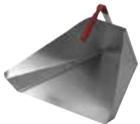
Transfer Scoop #2103