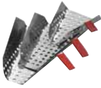
Perforated Jet Scoop (Right-Handed) #2072 Standard Stainless #2105 Large #2108 Jumbo