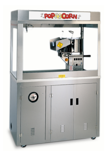
General 48" Enclosed Cornado shown for image reference only.