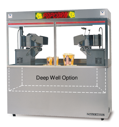
General 79" Enclosed Cornado with Deep Well Option shown for image reference only.