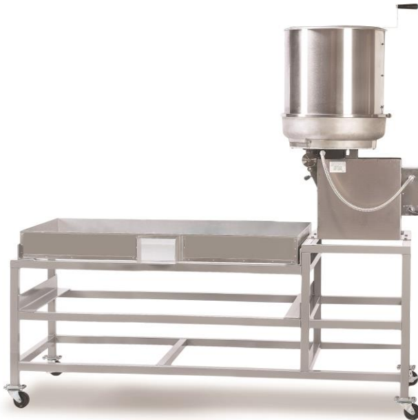
Truck with Corn Treat Unit shown for reference (Corn Treat Unit sold separately).