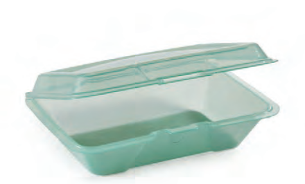
Half Size Food Container

EC-02-1- 9" x 9", 3.5" deep 23 cm x 23 cm, 8.9cm 1 dz.