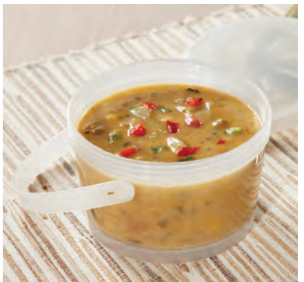
[1] "USF Dining is Styrofoam-Free" University of South Florida News. July 21, 2011