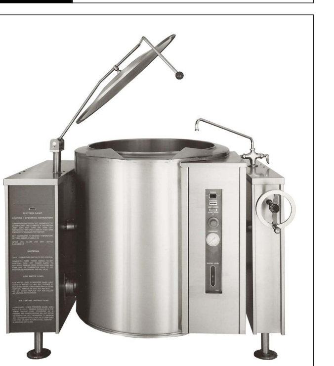
FT-40GL shown with optional Spring assist cover