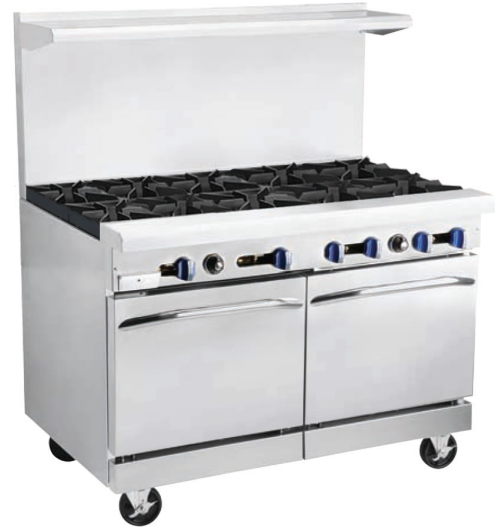
R-R10 shown with optional casters and shelf

Crated Dimensions - 42" D x 36" H x 62.5" W (1067mm x 914mm x 1588mm)