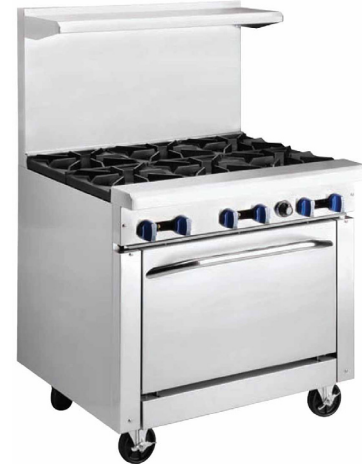
R-R6 shown with optional casters and shelf

Crated Dimensions - 42" D x 36" H x 38.5" W (1067mm x 914mm x 978mm)