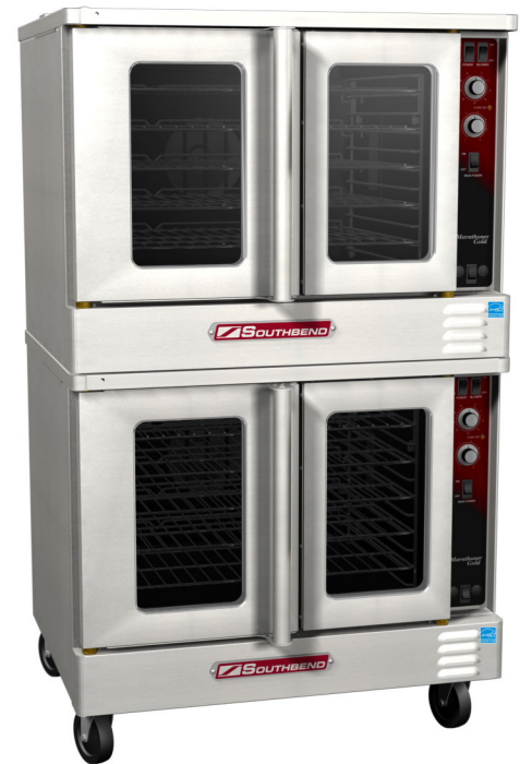
(ES20/SC shown with optional casters)

150°F to 500°F temperature controller with 140°F to 200°F "Hold" thermostat Dual digital display shows time and temperature. A fan cycle timer pulses the fan.