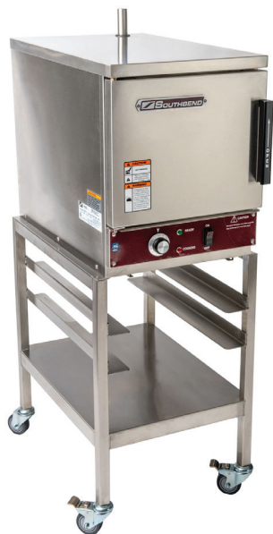
Model shown is an R18A-4 on an optional stand