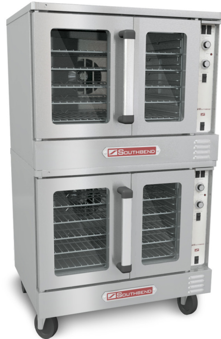
(SLGS/22SC shown with optional casters)