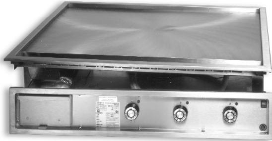
Model 136TDI shown