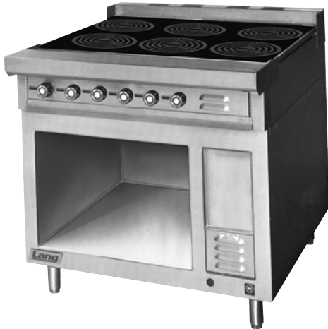
Model RI36B-ATE shown