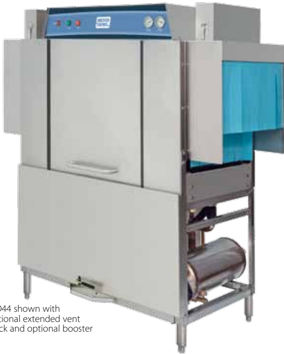
MD44 shown with optional extended vent stack and optional booster

High Temperature Rack Conveyor Dishwashing Machine