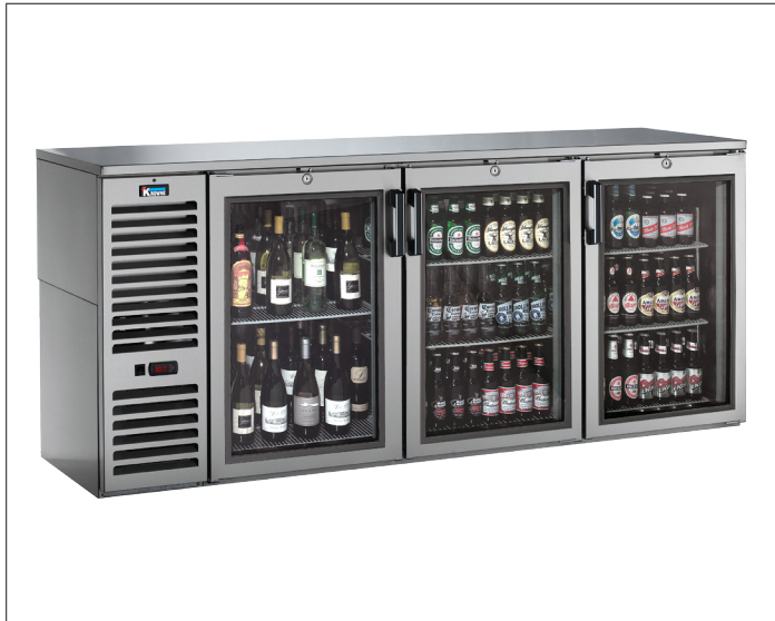
BS84L-KSS-LRR shown with optional 1" Top and Glass Door Upgrade

AVAILABLE IN 36", 60", 84", & 108" SIZES