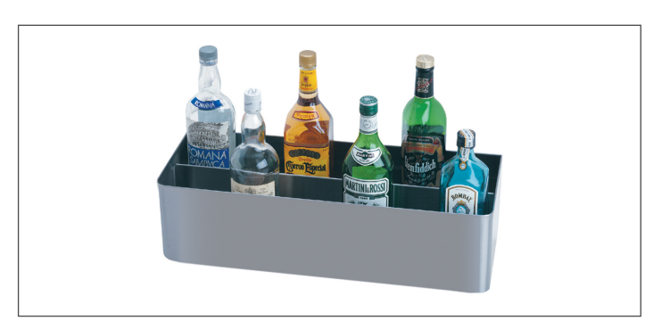
D-24 DOUBLE SPEEDRAIL SHOWN