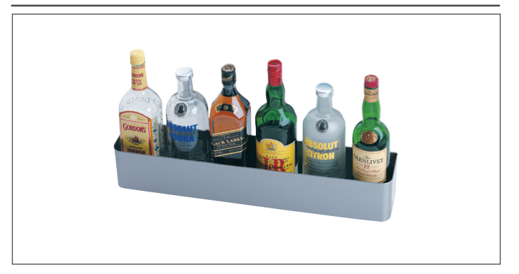
S-24 SINGLE SPEEDRAIL SHOWN