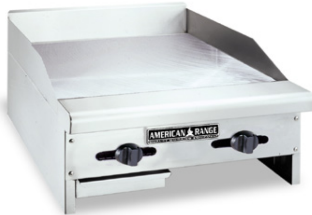
ACCG - 24