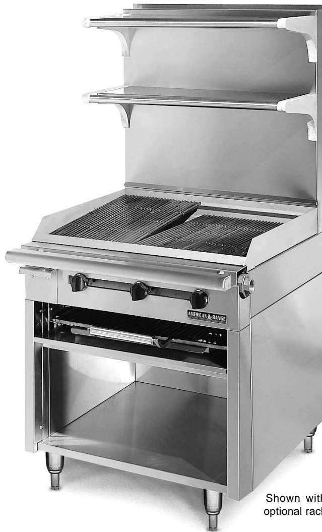
Shown with optional rack