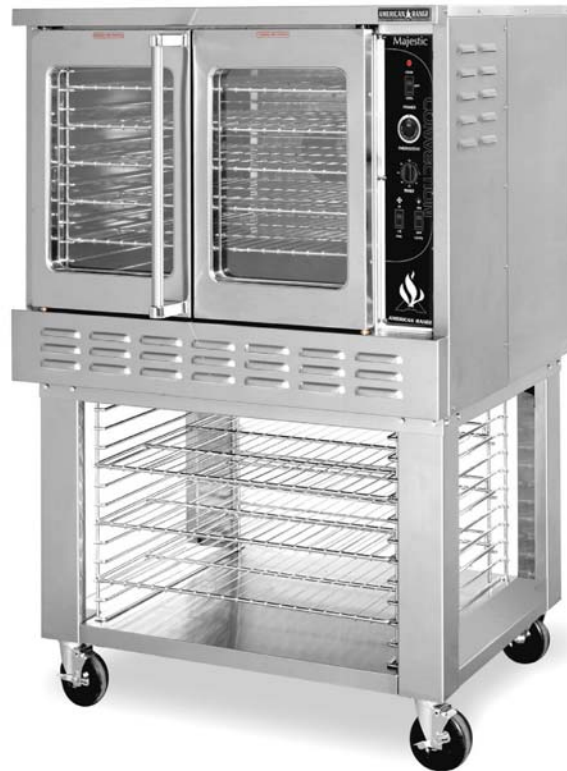
Shown with optional glass door & computerized control

American Range presents a new series of heavy duty majestic convection ovens. All stainless steel exterior construction for robust durability. Unique oven cavity baffle system provides maximum efficiency. Large size oven cavity is designed to accommodate full size sheet pans front to back or side to side. 5 racks with 12 positions allow for maximum capacity along with enhanced flexibility. Stainless steel burners w/75,000 & 90,000 BTU/hr. provide rapid heat and recovery. Two 40 watt oven lights provide improved visibility of the interior. Designed and built to provide superior performance and durability.