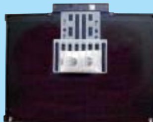
Back view of front panel