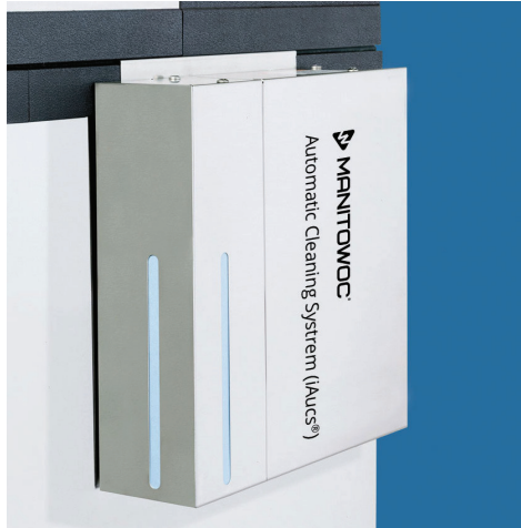
iAuCS for External Mounting