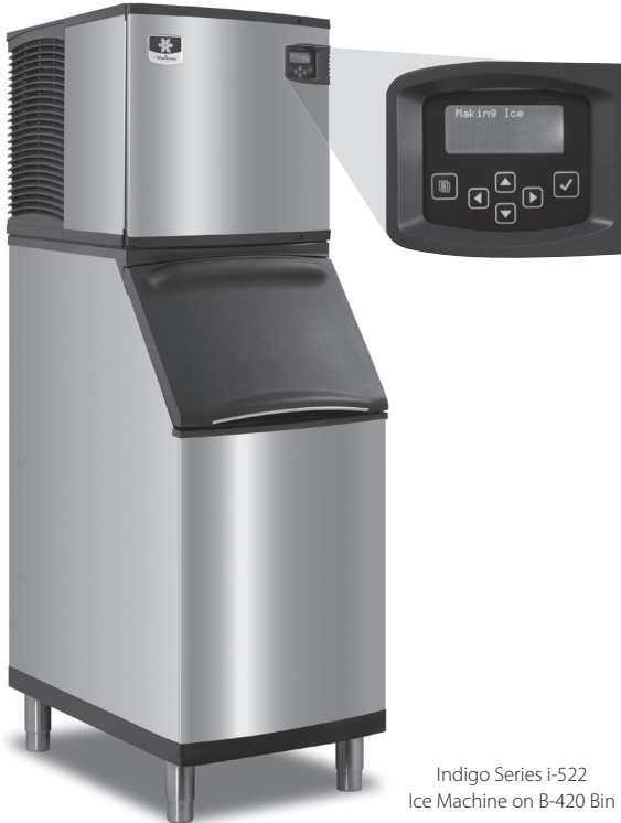
Indigo Series i-522 Ice Machine on B-420 Bin

Designed for operators who know that ice is critical to their business, the Indigo™ Series ice machine's preventative diagnostics continually monitor itself for reliable ice production. Improvements in cleanability and programmability make your ice machine easy to own and less expensive to operate.