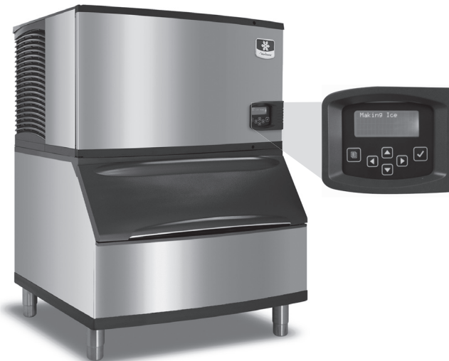
Indigo Series i-300 Ice Machine on B-170 Bin

Designed for operators who know that ice is critical to their business, the Indigo™ Series ice machine's preventative diagnostics continually monitor itself for reliable ice production. Improvements in cleanability and programmability make your ice machine easy to own and less expensive to operate.