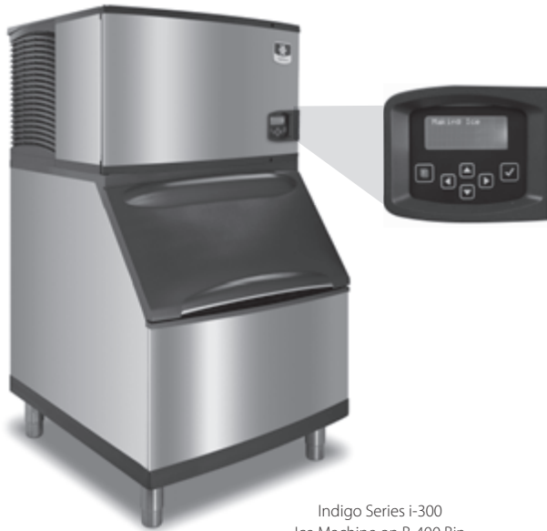
Indigo Series i-300 Ice Machine on B-400 Bin

Designed for operators who know that ice is critical to their business, the Indigo® Series ice machine's preventative diagnostics continually monitor itself for reliable ice production. Improvements in cleanability and programmability make your ice machine easy to own and less expensive to operate.