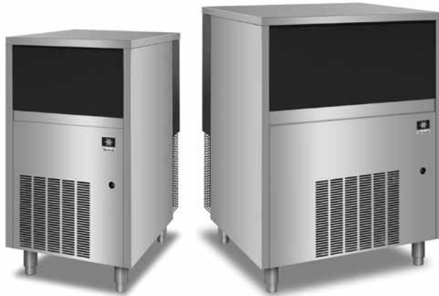
Model RNS-0244A Nugget Ice Machine