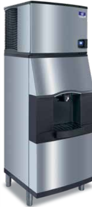
Indigo NXT iT0450 Ice Machine SFA-291 Ice & Water Dispenser