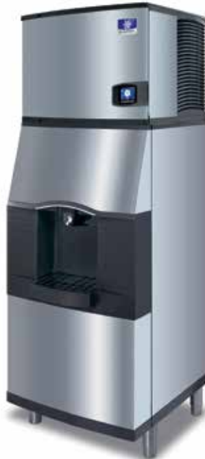
Indigo NXT iT0450 Ice Machine SPA-310 Ice Dispenser

With Indigo and Indigo NXT ice machines you can program the ice machines to be off certain hours of the day so that while the hotel guests are sleeping, the ice machine can be too!