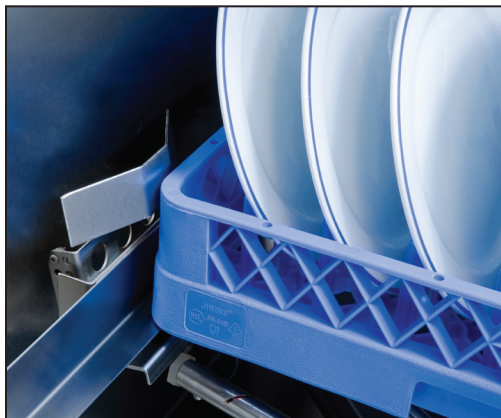
RackAware™ Automatic Rack Sensing System* only runs a cycle when a rack is present