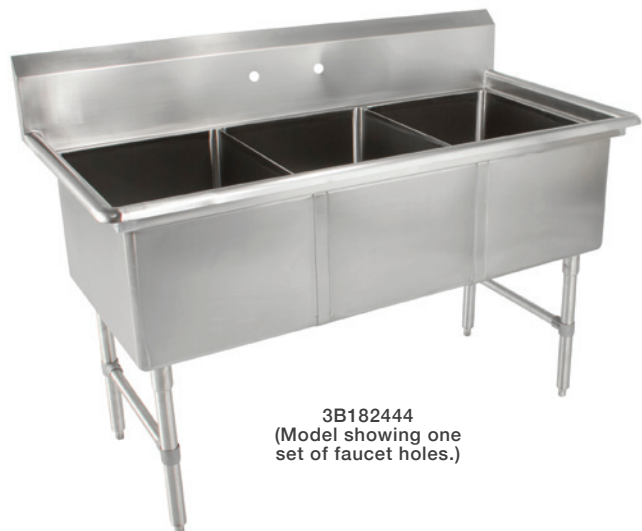
3B18244 (Model showing one set of faucet holes.)