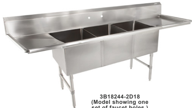
3B18244-2D18 (Model showing one set of faucet holes.)