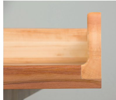
COVED RISER (FRONT VIEW)