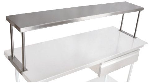
OS-ES-1248 (Does Not Include Table)