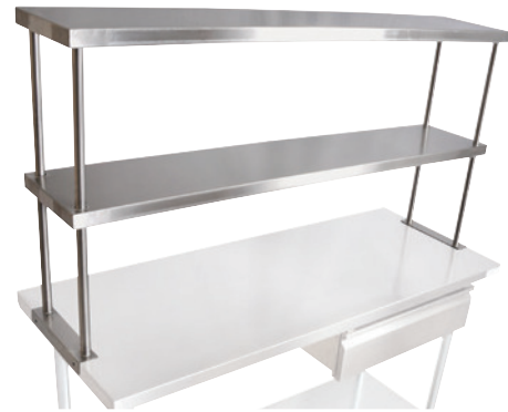
OS-ED-1248 (Does Not Include Table)

DOUBLE OVER SHELF WITH ADJUSTABLE MID SHELF