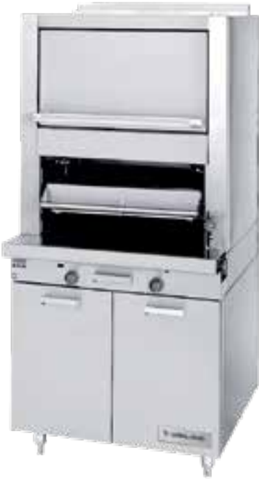
Model M60XS Ceramic Broiler with Upper Finishing oven