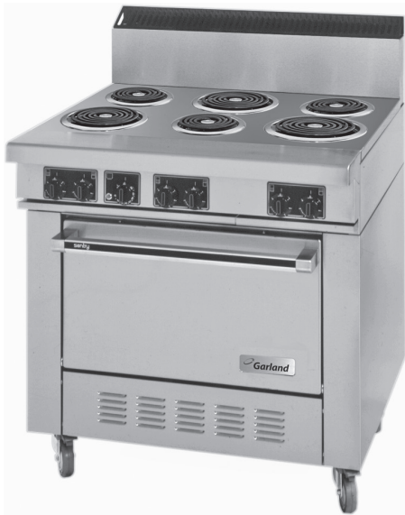
Model S686 (shown with optional casters)

NOTE: Ranges supplied with casters must be installed with an approved restraining device.