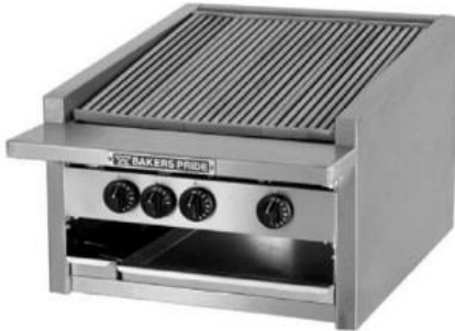
Model L-24R with floating rod top grates and optional 4" legs