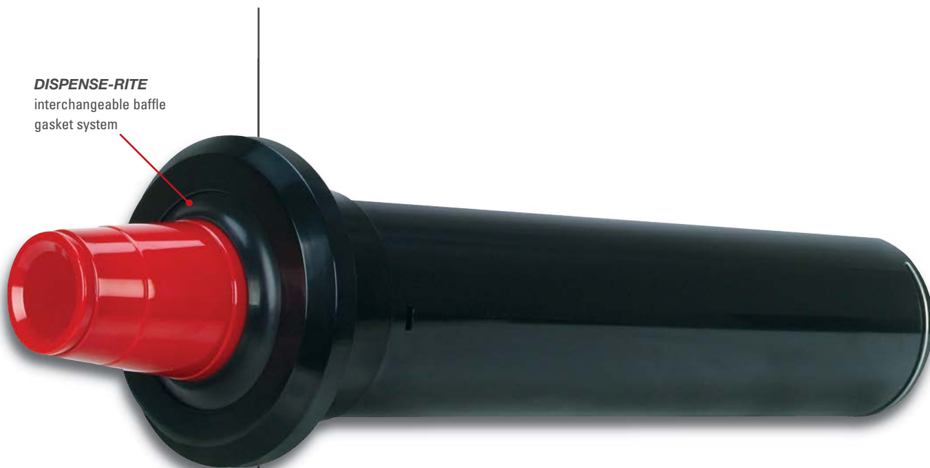
DISPENSE-RITE interchangeable baffle gasket system