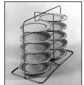
"P" carrier for open plates

OPTIONAL PLATE CARRIERS... "P" or "C" carriers are available. "P" type holds 8-3/4" to 10-1/2" diameter open plates while "C" type holds up to 10-1/2" diameter covered plates. Specify type, if any, when ordering. Carriers will hold plates 4-high (8C or 8P) in carts with 13" shelf spacing and 5-high (10C or 10P) in carts with 16" shelf spacing. See table on front page for types and quantities that will fit in each cart.