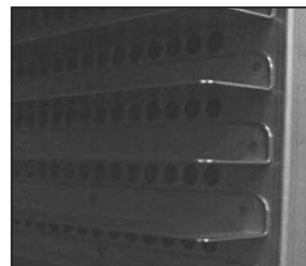
Optional fixed angle slides