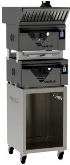
VK-VH Hood, 2 VK ovens, VK-SK Stacking Kit, VK-OS1 Oven Cabinet