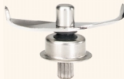
Blade wing-span of almost 4 inches

Big ice cubes? Frozen fruit? Bring it on! No blending job is too tough for this rugged blade.