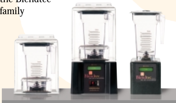
In-Counter Smoother ™