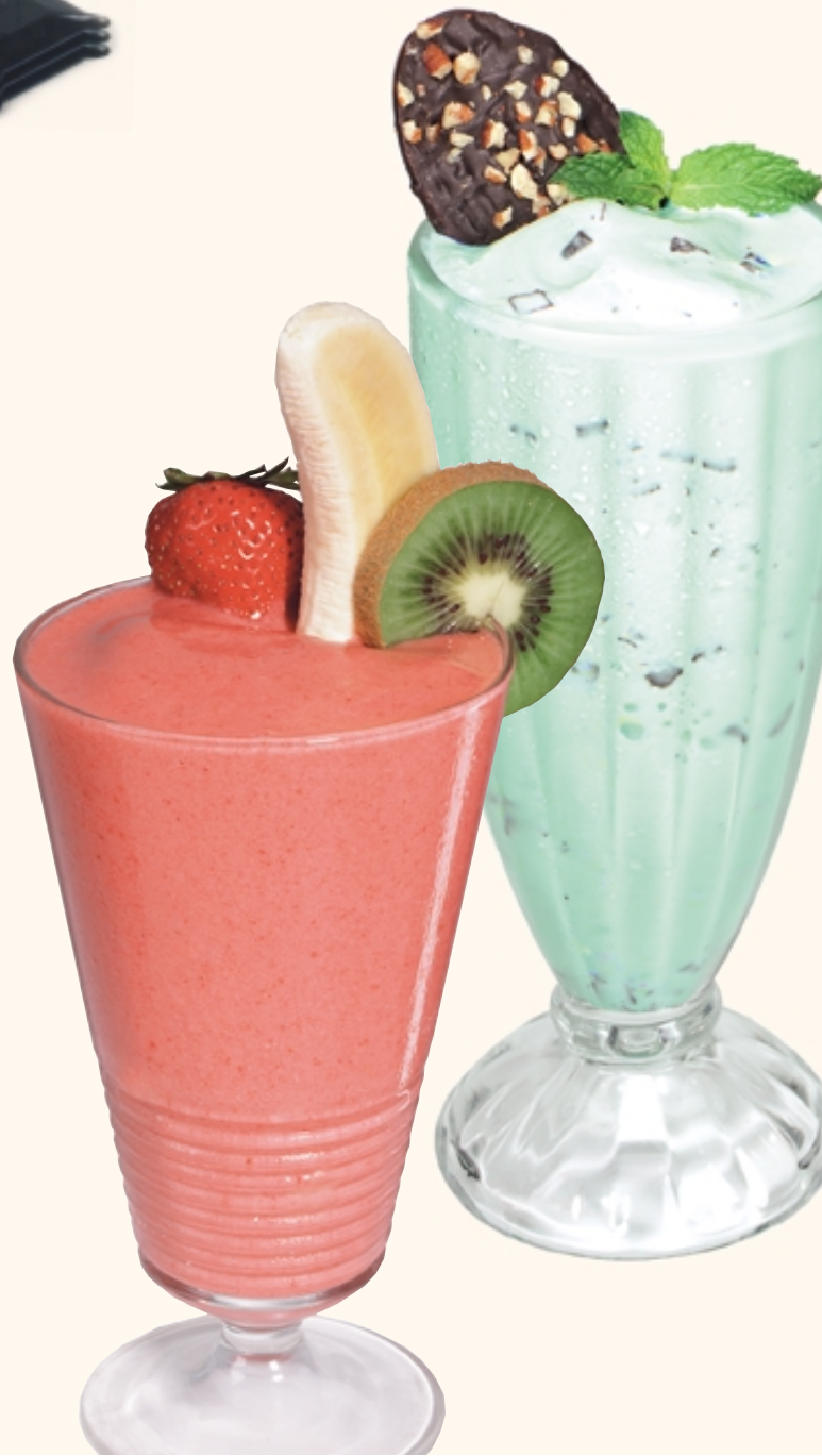
In-Counter Smoother TM