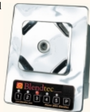
LEDs show which blend program has been selected.

A sleek membrane touchpad controls the most advanced blending electronics on the market—eliminating less reliable knobs, dials, and switches that often break or wear out.