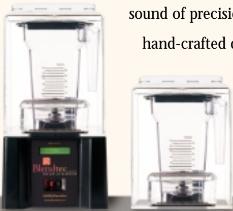
Above-Counter Smoother TM

"Shhhh." Our blenders are often found in bookstore cafes. What you hear is the quiet sound of precision and hand-crafted quality.