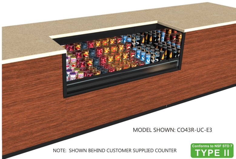
MODEL SHOWN: CO43R-UC-E3

Lengths include end panels 36-1/4"L x 32-3/8"D x 32-3/4"H 47-1/4"L x 32-3/8"D x 32-3/4"H 59-1/4"L x 32-3/8"D x 32-3/4"H 71-1/4"L x 32-3/8"D x 32-3/4"H