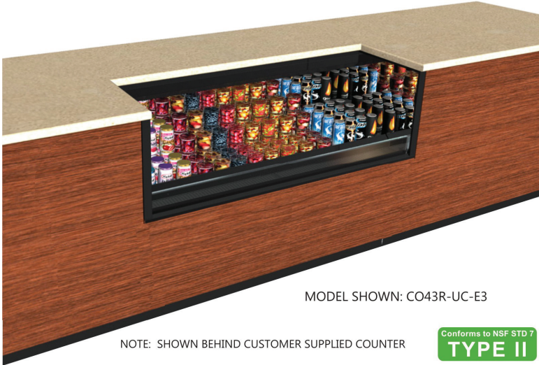
MODEL SHOWN: CO43R-UC-E3

Lengths include end panels 36-1/4"L x 32-3/8"D x 32-3/4"H 47-1/4"L x 32-3/8"D x 32-3/4"H 59-1/4"L x 32-3/8"D x 32-3/4"H 71-1/4"L x 32-3/8"D x 32-3/4"H