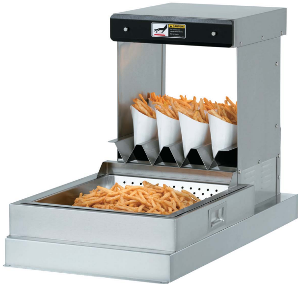
BKI's FW-12 Fry Warmer attached to Tabletop Riser